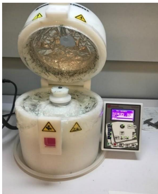
Fig. 2. Spin coater model WS-650MZ-23NPPB