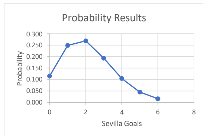
Fig 2: Model Building